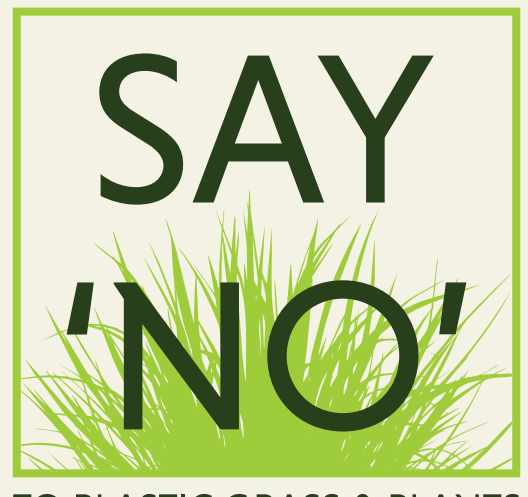
TO PLASTIC GRASS & PLANTS